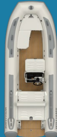
520 7 PERSONS