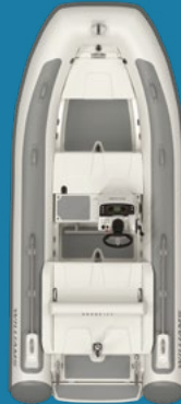
435 7 PERSONS