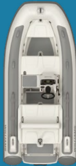
395 6 + 1 PERSONS