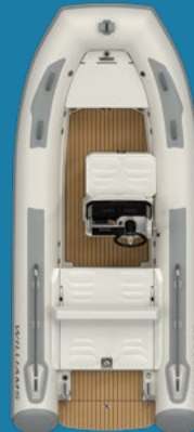
460 6 PERSONS