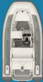
345 5 PERSONS